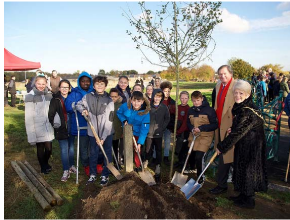
Area 1: Bulwell & Bulwell Forest Wards Parks Improvement Plan